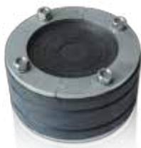
Varia 1.0 split