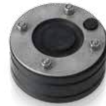
Varia 1.5 ND 100 LWL