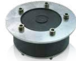
Varia 1.5 with large flange ND 100