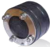
Varia 1.5 ND 80