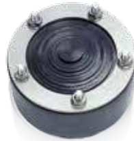
Varia 1.5 ND 100