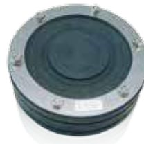
Varia ND 150